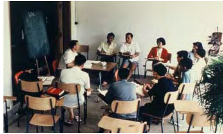
King's Road, September, 1968

DTC's ethos of training has remained essentially unchanged throughout its forty years. However, there have been various curriculum changes in this period. From 1968–1976, the curriculum was shaped by the requirements of the London University's Diploma in Theology (Dip Th.) since DTC had decided that students would prepare for the external London Dip. Th. One rationale for this was to establish DTC's academic credibility by linking up with a reputable external examining institution.