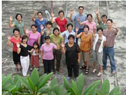
Chancery Lane, August, 2008